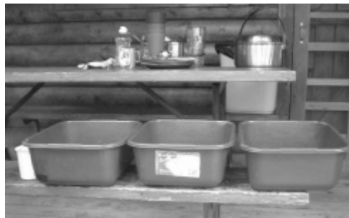
Tub A Tub B Tub C

Now it is time to get the three tubs out. Work them from left to right